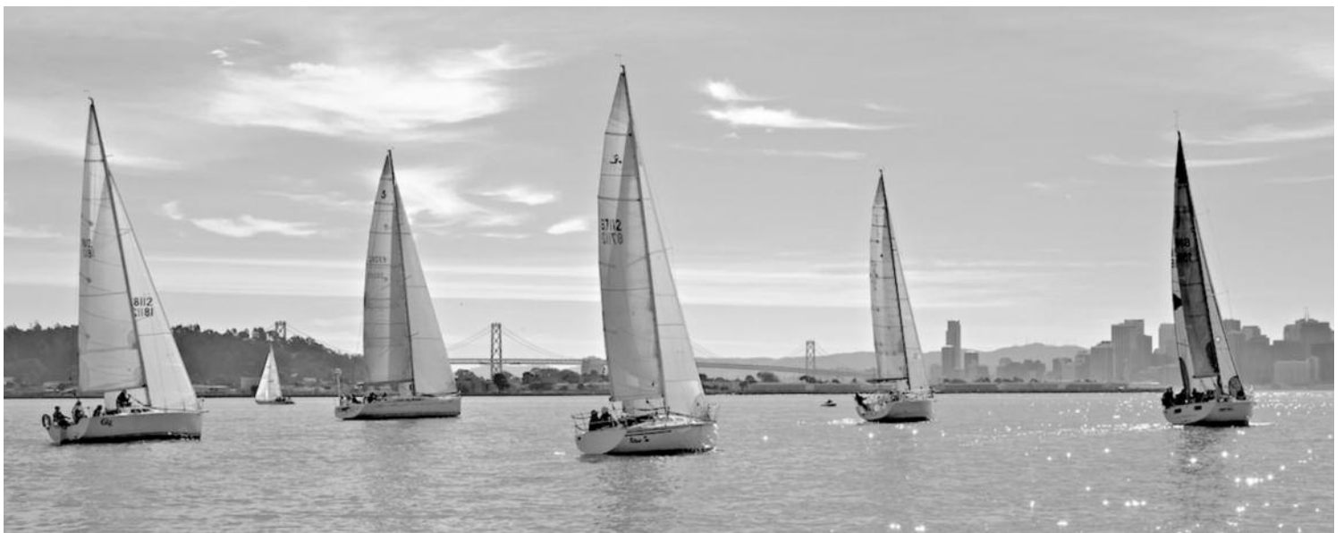
Some of the participants in January 22nd Jack Frost Series