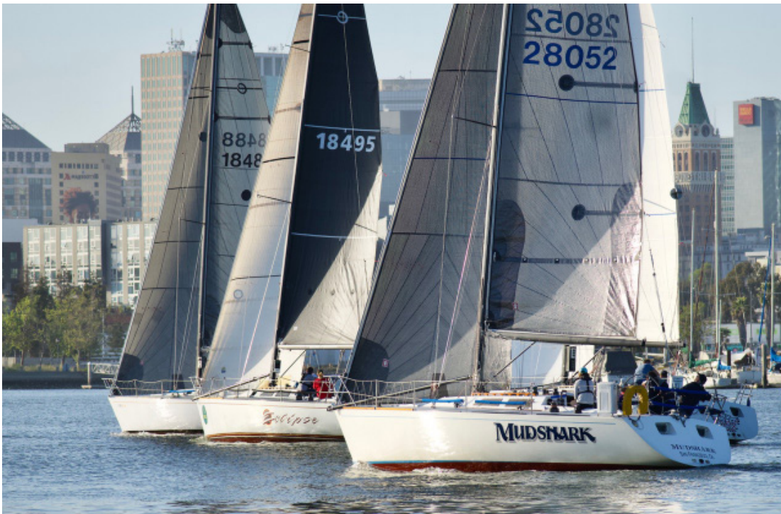
Beer Can Races