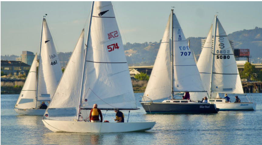
Beer Can Races