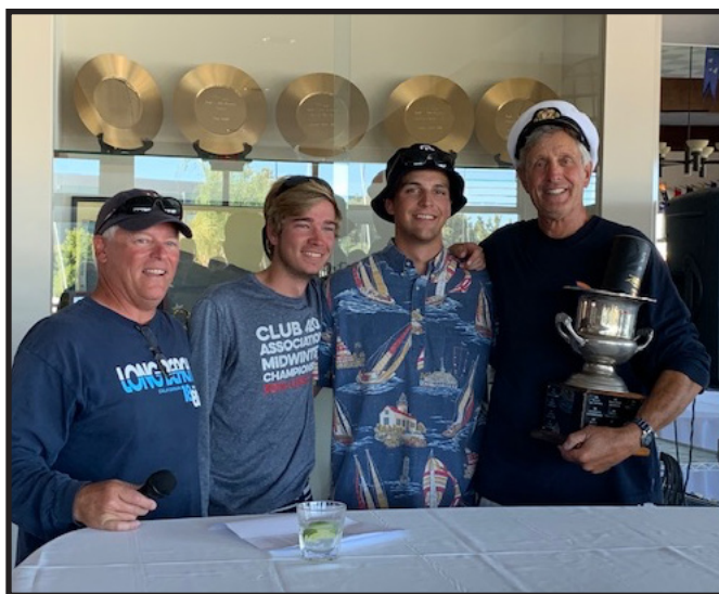
Commodore's Cup Winners