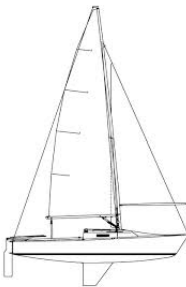
SV: Blue Jay

have additional questions about the Blue Jay and becoming a certified skipper please reach out to me at the above email address or anyone of your other Flag officers.