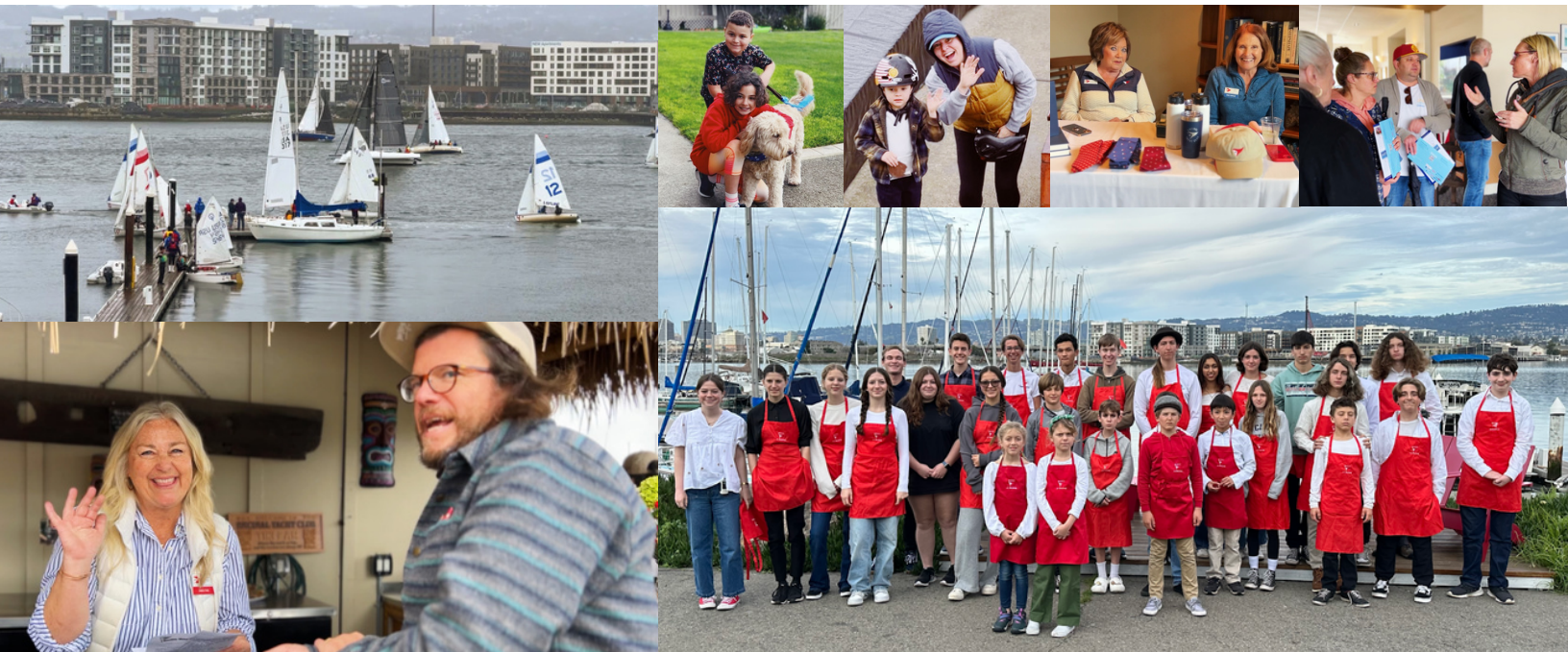
Members volunteered at EYC's Annual Open House hosting prospective members and the Junior Sailing Program hosted it's Annual Crab Feed .

Follow @EncinalYachtClub on Instagram For the latest Snapshots from EYC Events