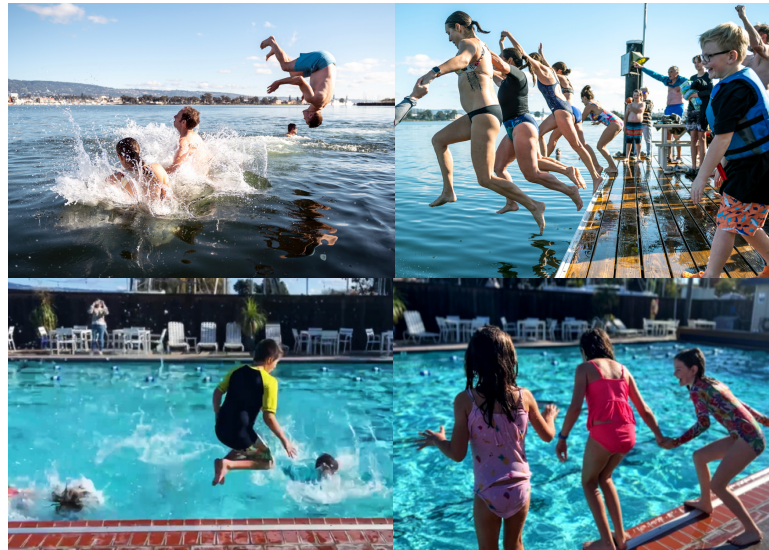
Members jumped into the New Year with a burst of energy and optimism as they fearlessly embraced the frigid waters during the highly anticipated third Annual Polar Bear Plunge !