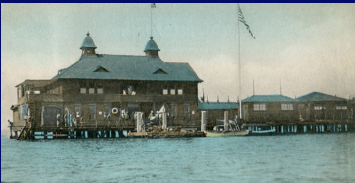
Encinal Yacht Club's original clubhouse was an enduring icon for the local community for nearly 65 years.