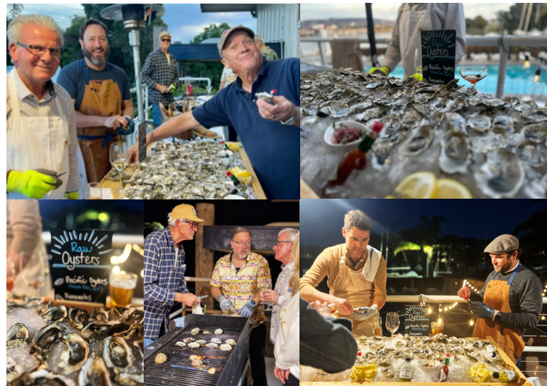
Members and guests were treated to a mouthwatering spread of fresh Pacific Oysters paired with delicious champagne at the inaugural Oysters and Champagne Night .